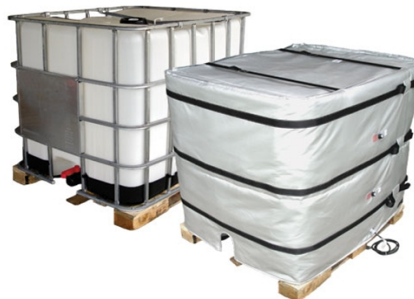
Full Coverage IBC Tote Tank Heaters