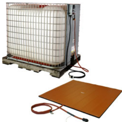
Partial Coverage Tote Tank Heaters